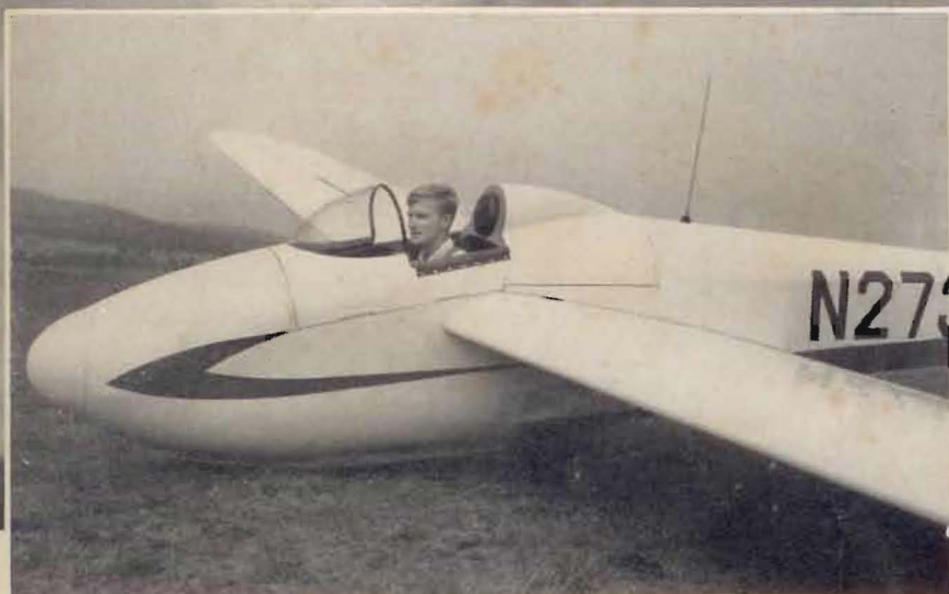
Sport Canopy for Summer Soaring