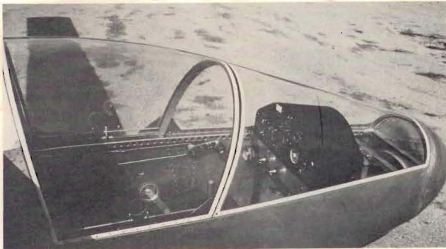
The Helisoar HP-10 canopy and cockpit area. Note the flat-wrap plexiglas forward for assured good visibility.

them fit existing kits at a later date. The list includes such items as a new quick wing joint, droop ailerons, faired wing tips housing the aileron counter weights, clamshell wheel fairings, a possible retractable wheel, and of course that dreamed of self-launcher.