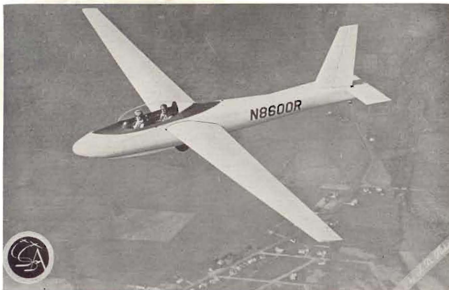
SOARING POST CARDS FOR SALE: As pictured above featuring an in-flight photo of the Schweizer 2-32 sailplane. Actual size is 3 1/2" by 5-7/16". This is the only photo now available; however, if the market demand warrants it, others will be added to the line. Price: 10 cents each (8 cents in quantities of 10 or more). Order from SSA, Box 66071, Los Angeles 66, Calif.