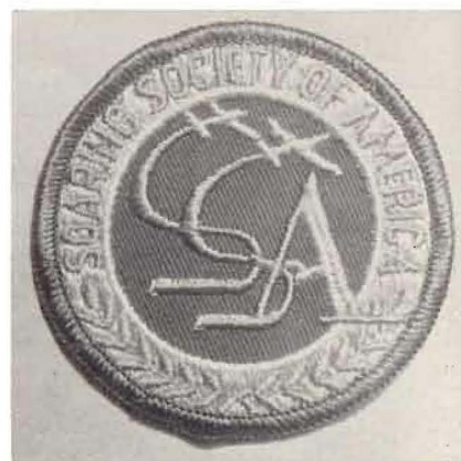
The SSA sew-on emblem, 2-7/8 in. in dia., gold-yellow and white on blue, available for 65 cents each, tax included. Order from SSA, Box 66071, Los Angeles 66, California.