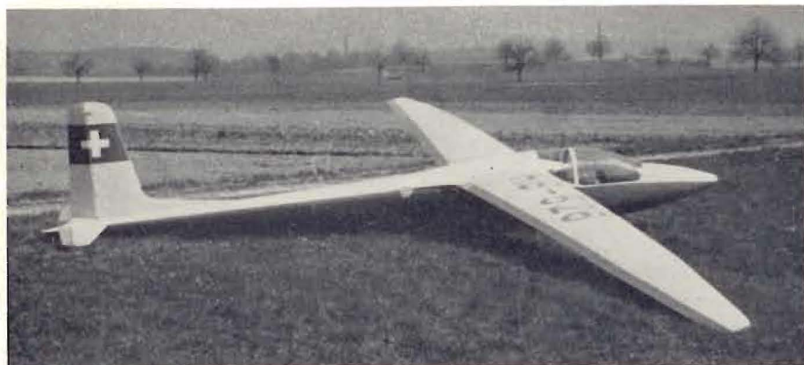
The Swiss Elfe PM3 sailplane which Rene Comte expects to fly in the 1962 U.S. Nationals. It is supposed to have a glide ratio of 40 to 1 or better at 63 mph. Some of its specifications are: empty weight, 730 lb.; gross weight, 940 lb.; wing loading, 7 lb./sq. ft.; span, 52.5 ft.; full span airfoil flaps; placard speed, 125 mph.; dive brakes; droppable dolly; and construction is all-wood monocoque sandwich.

Stay-at-homes desiring Nationals Daily Bulletins may obtain same free by sending 12 self-addressed, stamped envelopes to the 29th Nationals, El Mirage Field, Adelanto, Calif.