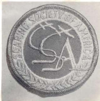
The SSA sew-on emblem, 2-7/8 in. in dia., gold-yellow and white on blue, available for 65 cents each, tax included. Order from SSA, Box 66071, Los Angeles 66, California.

For those who have been putting off ordering old Soarings , the remaining supply of the following issues is now less than 25 and they are going fast: J-F 42, M-A 43, J-F 47, J-F 49, M-A 49, J-F 51, M-A 51, N-D 53, N-D 54, J-F 57 and Nov. 59. Refer to the classified ads for the remaining issues that are still available and ordering information.