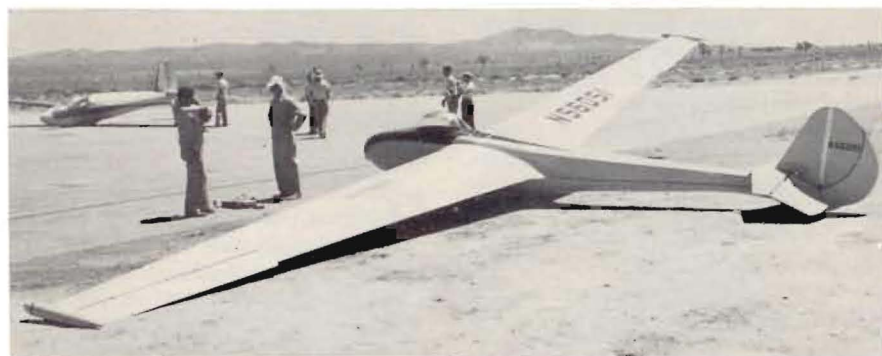
Figure 16. Prize for "Most Modified" L-K must go to Larry Bell, who not only flat-topped his ship, but added a retractable wheel, shortened ailerons, shortened horizontal tail span, and extended length of aft fuselage besides squaring off wingtips and adding tip fairings.