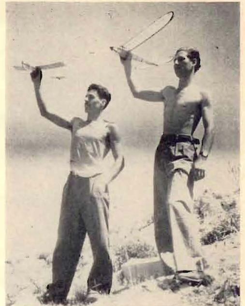
Two Greek Air Scouts with models built by their leader, Peschke.