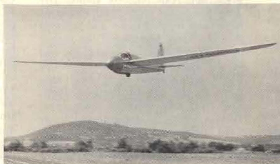
1-23 Schweizer → 1953

The Elmira Area Soaring Corporation is again happy to serve members of the Soaring Society of America.