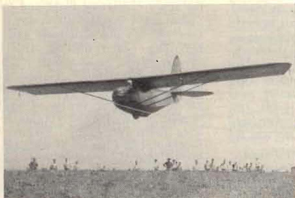
Franklin Utility 1930