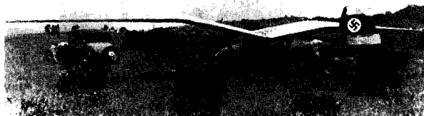
The "Moazagotl" which placed second