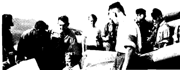
Hanna Reitsch prepares to take off

The Swiss sailplanes attracted more attention than any of the others as they were so small and light that they seemed more like models. Their performance, however, was about equal to the best.