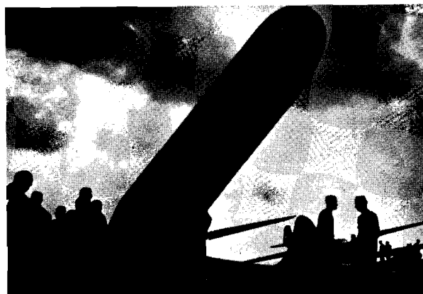
Men and Ships—Sunset on the Wasserkuppe

The Germans deserve much credit for their smooth operation of the Contest. The committees had carefully considered all the possible problems that might arise. The only difficulty that developed was the treatment of the pilots who landed in Czechoslovakia. Reports are that one Swiss contestant was shot at and that several of the Germans put in some time in their jails.