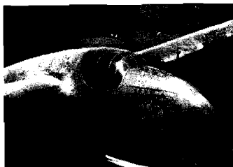
Close-up of the cockpit of the Sau Paulo, which also holds the world's altitude record.

Over half of the flying days were in favor of those who knew the country, that is, to make distance flights slope soaring had to be done in the morning until the thermals built up to enable the pilots to get under way. The relative standing of the teams of the seven countries competing was as follows: Germany (6634.5 Points); Poland (2597 Points); Switzerland (2217.7 Points); England (1055.5 Points); Austria (275 Points); Czechoslovakia (89 Points); Jugoslavia.