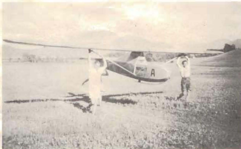
H-17, weight 145 pounds

Full details, with prices, on this Kit will be given in a later number of Soaring .