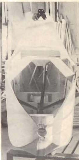
Unfinished fuselage of the H-17 sailplane

The wings have been attached to this H-17 sailplane and are being made ready for alignment of fittings and the measurement of struts. Part of fuselage is still open so final measurements can be made of the length of the aileron push rods.